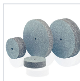
webrax Non-woven web laminated wheels/rollers