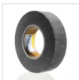
webrax Non-woven web flap wheels/rollers