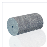
webrax Non-woven web unitized grinding tools