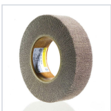
webrax Non-woven web flap wheels/rollers