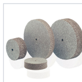
webrax Non-woven web laminated wheels/rollers