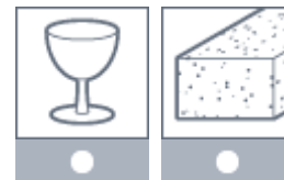
Glass and Ceramics