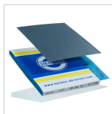
Sheets 230 x 280 mm