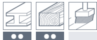
Metal Wood Lacquer