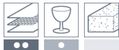
Composite Glass and Ceramics Stone