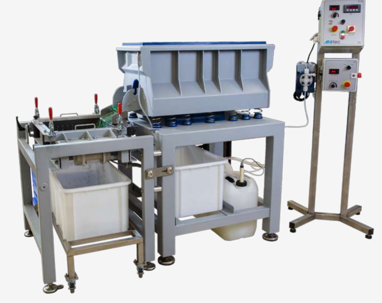
Trough vibrators for smooth deburring or gentle polishing