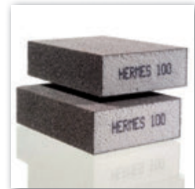
Four-sided with imprint grit size

Stock items, other dimensions and grit sizes on request.