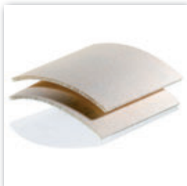
VC 154-Longlife FOAM