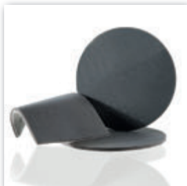
FineNet FN 915, velour-backed