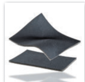
FSSS 105, single-sided, super soft

Stock items, other dimensions and grit sizes on request.