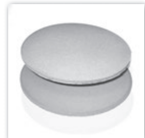
FMA 105, velour-backed

Stock items, other dimensions and grit sizes on request.